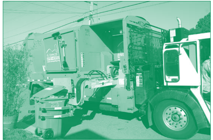
An automated arm grabs a recycling cart and tips the contents into the truck.