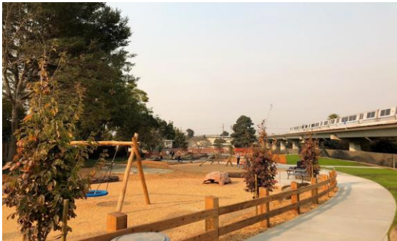
Centennial Park: 78,000 Square Feet Park Project: Improvements to existing neighborhood park Costs: $700,000 (estimate)