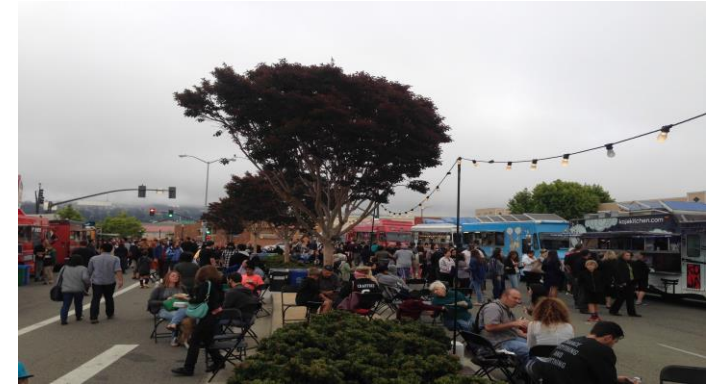
Downtown Plaza (Lower Fairmont): 18,000 Square Feet Street Opportunities: Pocket Parks, Connectivity, Activity Node, re: Streets Costs: $465,000 - $670,000