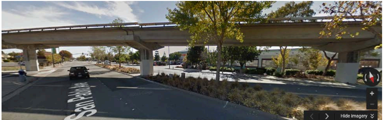
San Pablo Ave Northern Gateway