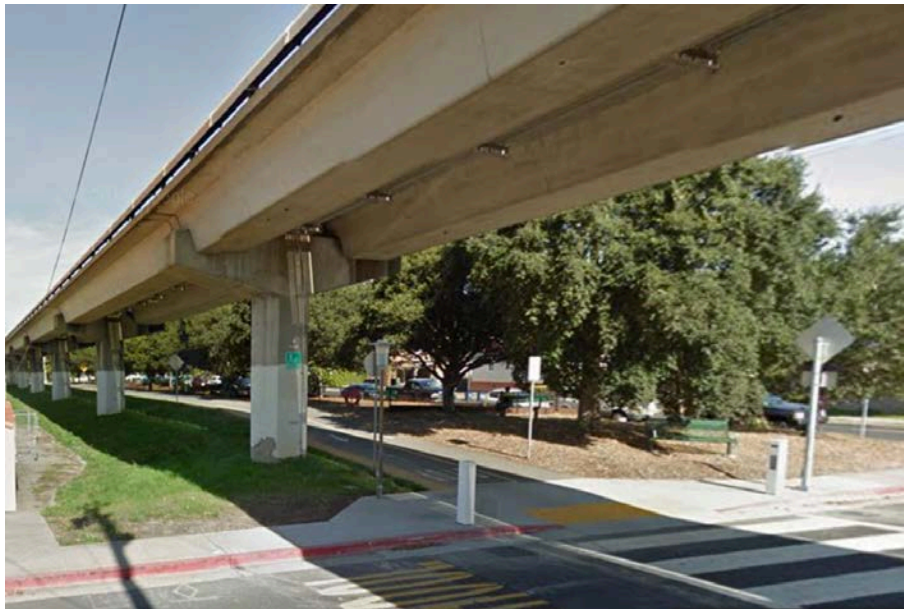
Potrero at King Dog Park